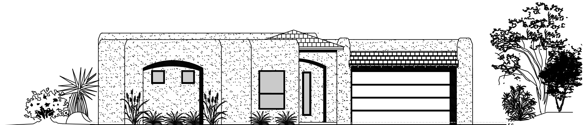
FLAT FRONT ELEVATION